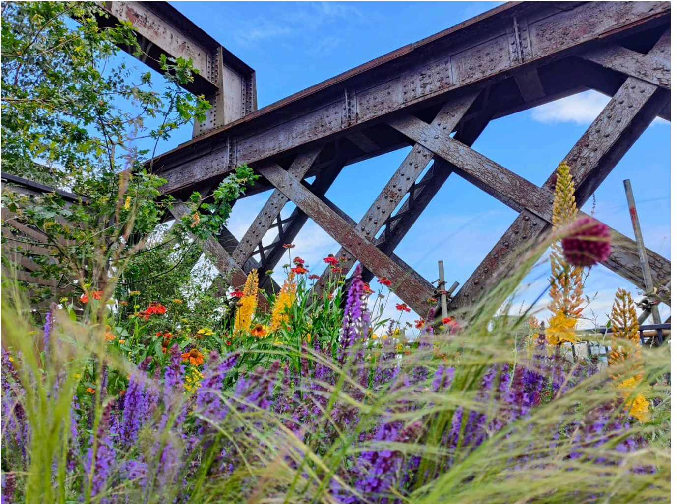
Castlefield Viaduct: our community plot.